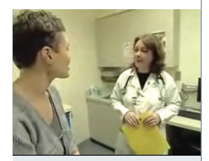
Video Spotlight: Different Breast Cancers Breast Cancer Treatment: Get Involved

These numbers only give a general idea of breast cancer risk. The key to coping with a fear of breast cancer is knowing what puts you at risk and then taking steps to lower your risk.